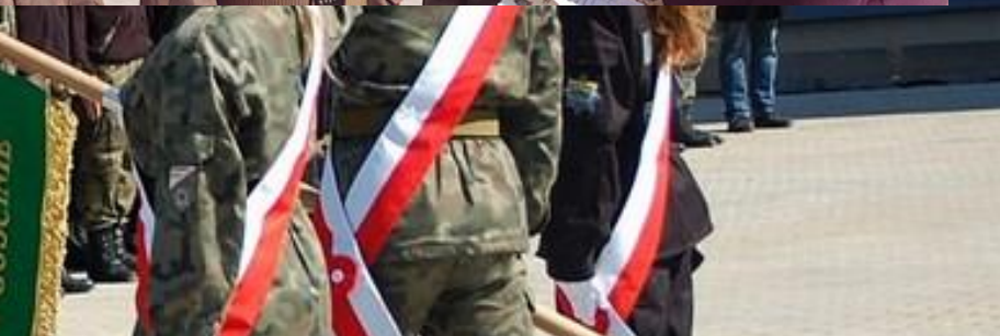
KLASA STRAŻY GRANICZNEJ